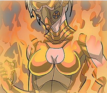
Inflammable, in her most recognizable outfit, engulfed by flames and ready to strike

All in all, it was nothing more than just a nice occurrence to see her again. Maybe she is a bit out of touch with the general life of a hero. If so, now would be the best time to come back. With new dangers at the horizon, we need the great flamey Momma again, to get us out of the villain detention we were put into.